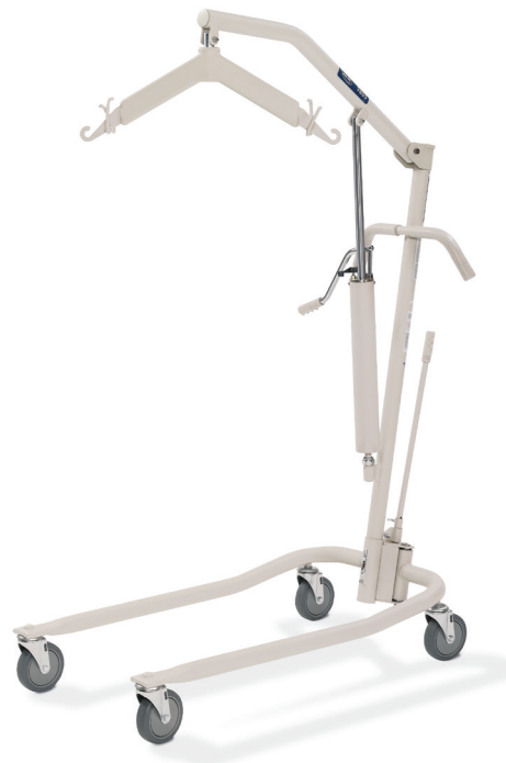
1. Adjustable base Model # 9884